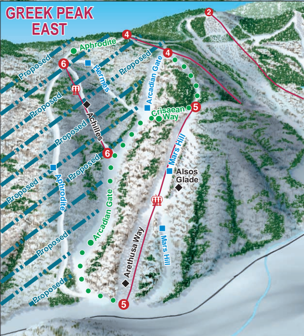
Map for illustrative purposes only.